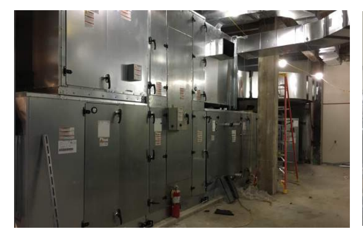
Area F 3rd Floor AHU Assembly