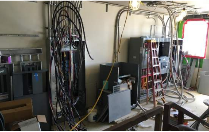
Area A Washington Level Electrical Room