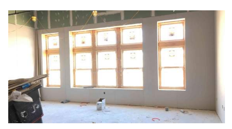
Area A 3rd Floor Drywall Installation