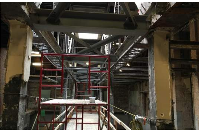
Area G Structural Steel Installation